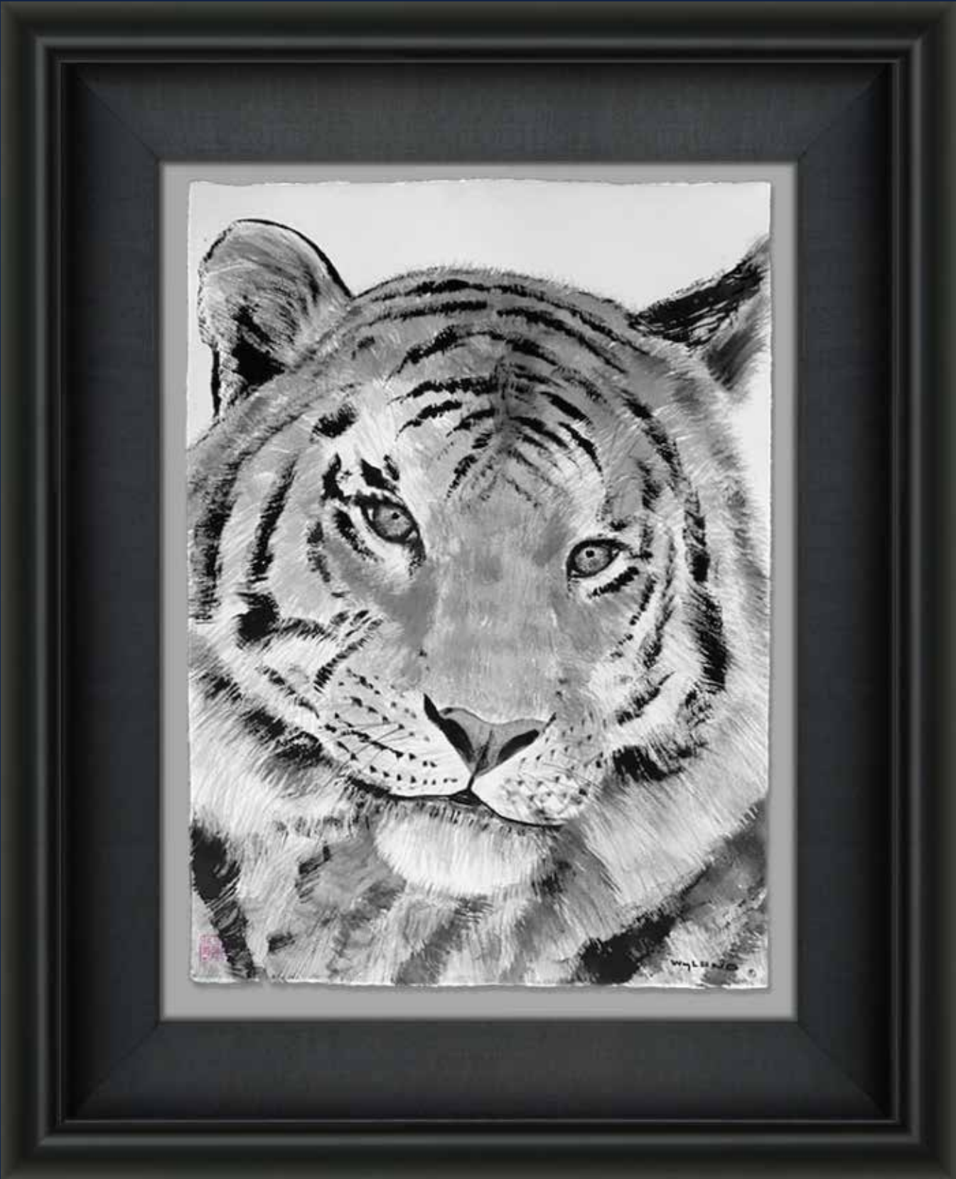
"The Tiger" original Chinese brush painting by Wyland