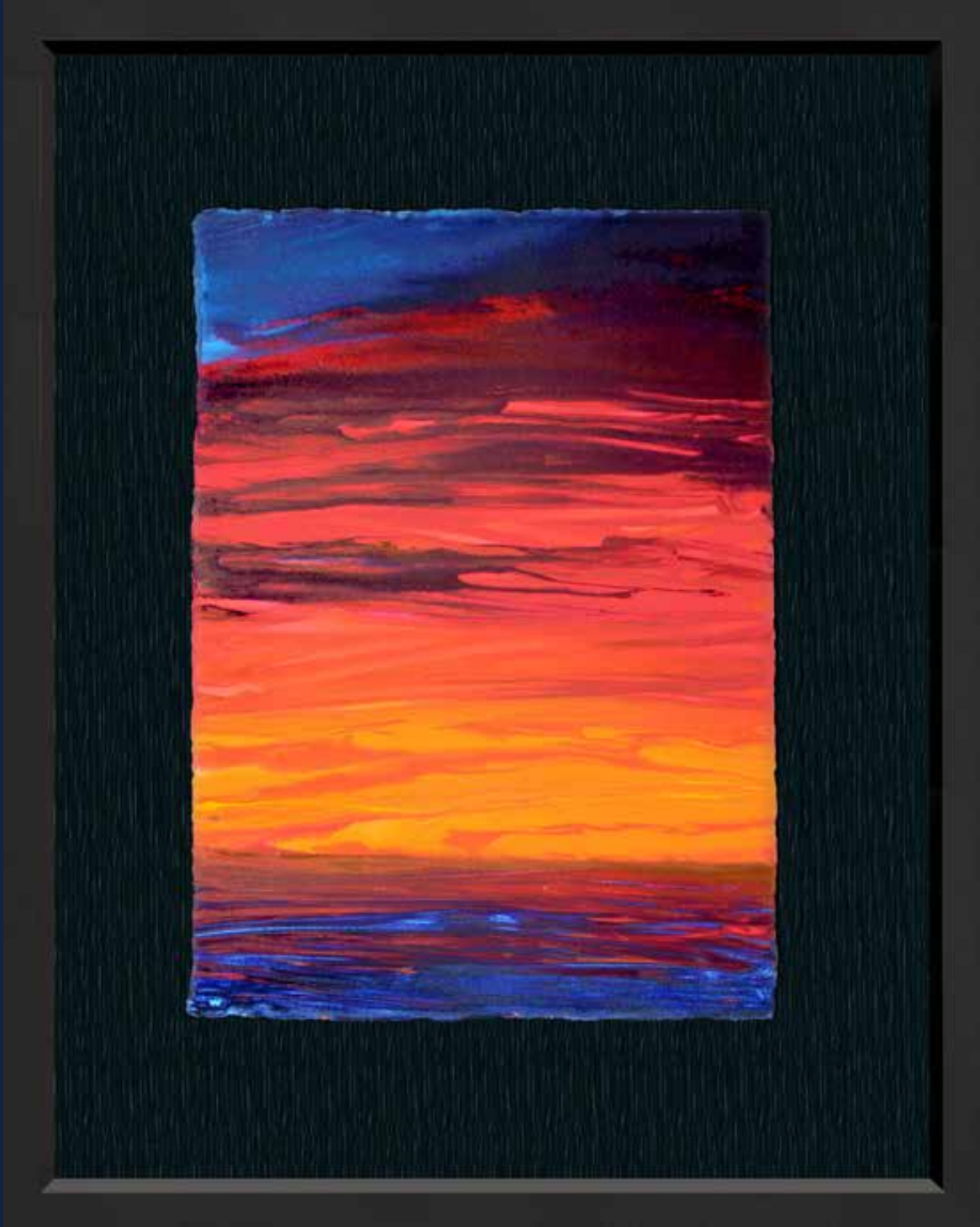
Original abstract watercolor painting by Wyland