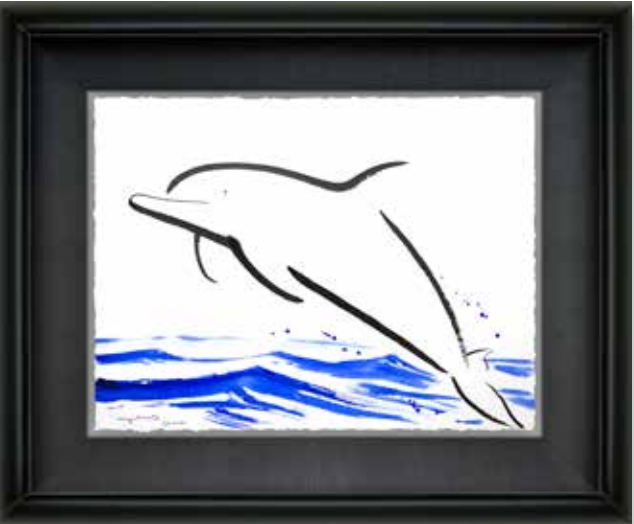
Wyland original Sumi-e “Ocean Blue” brush art painting