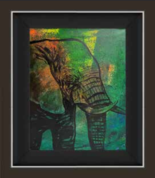
Street Art - Elephant, original oil painting by Wyland