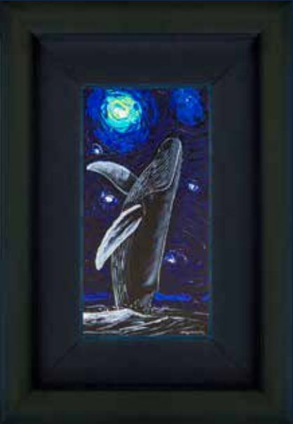
Starry Breach, original oil painting by Wyland