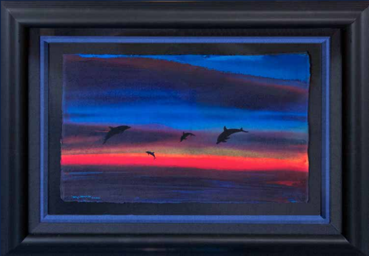
Original abstract realism watercolor painting by Wyland