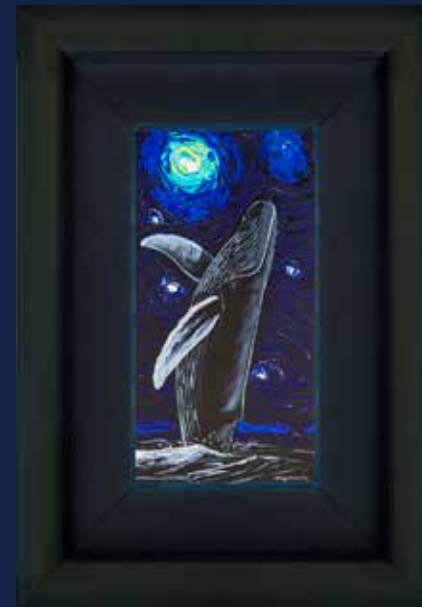
Starry Breach , original oil painting by Wyland