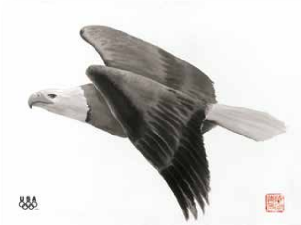
Bald Eagle, One of Wyland’s original Chinese brush painting for the U.S. Olympic Team.