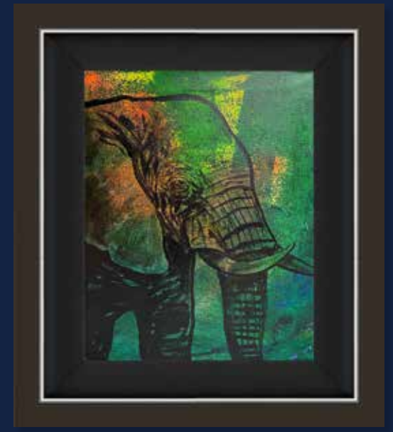
Street Art - Elephant , original oil painting by Wyland