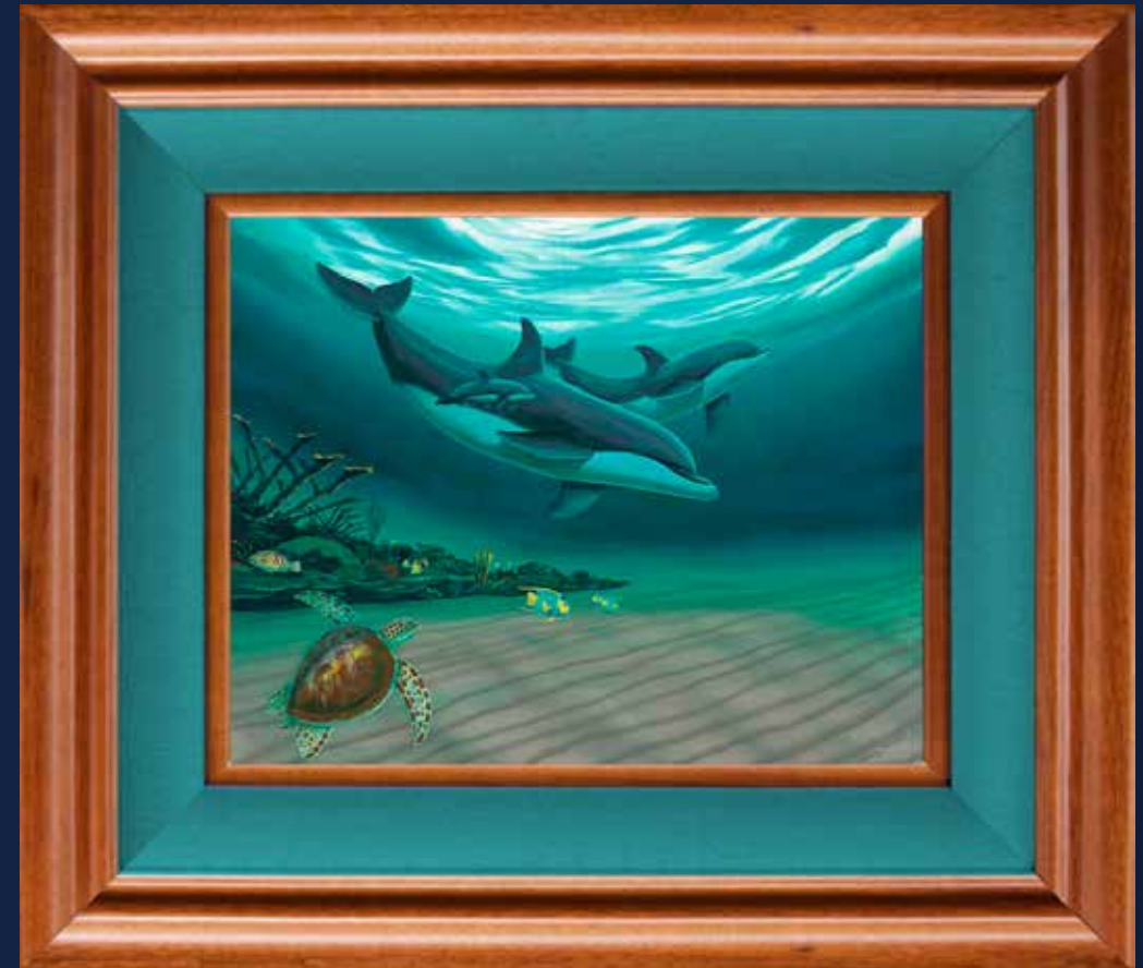
Celebrate the Sea , original oil painting by Wyland