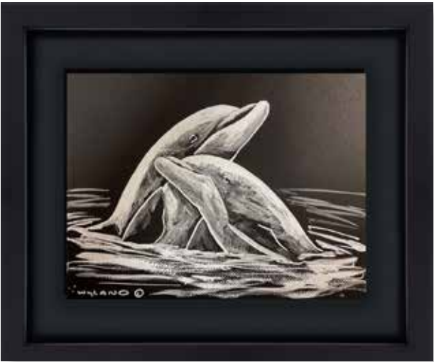
Wyland original drawing “Silver Collection”